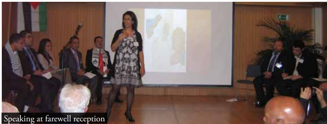
Speaking at farewell reception