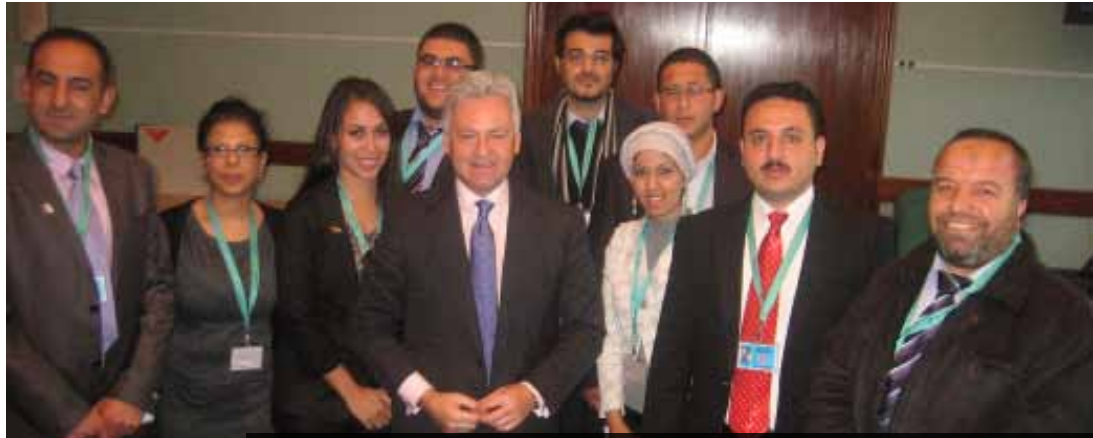
With Alan Duncan MP (centre) Minister for International Development