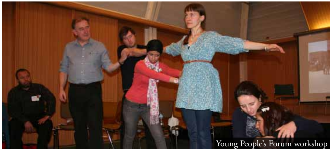
Young People's Forum workshop