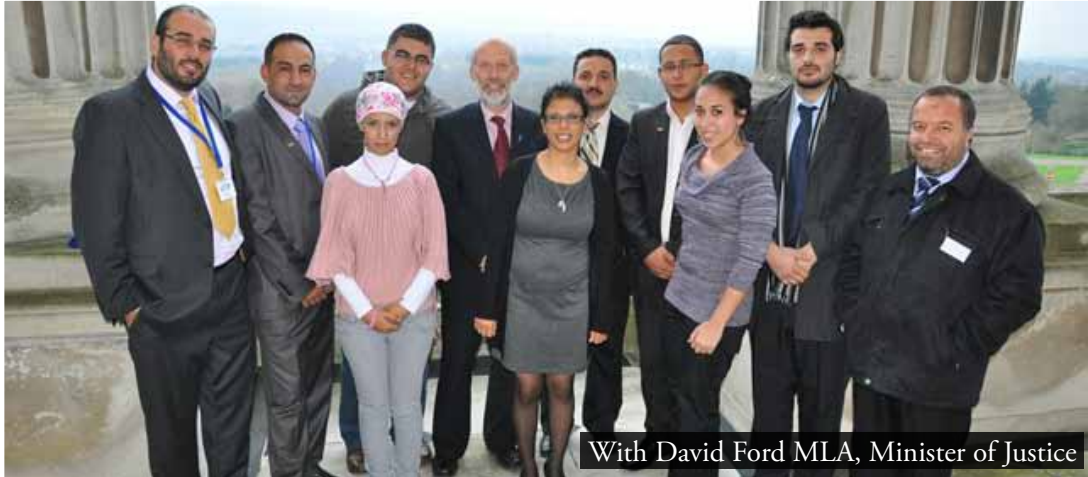
With David Ford MLA, Minister of Justice