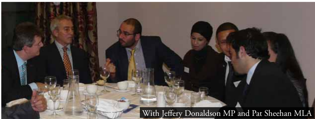
With Jeffery Donaldson MP and Pat Sheehan MLA