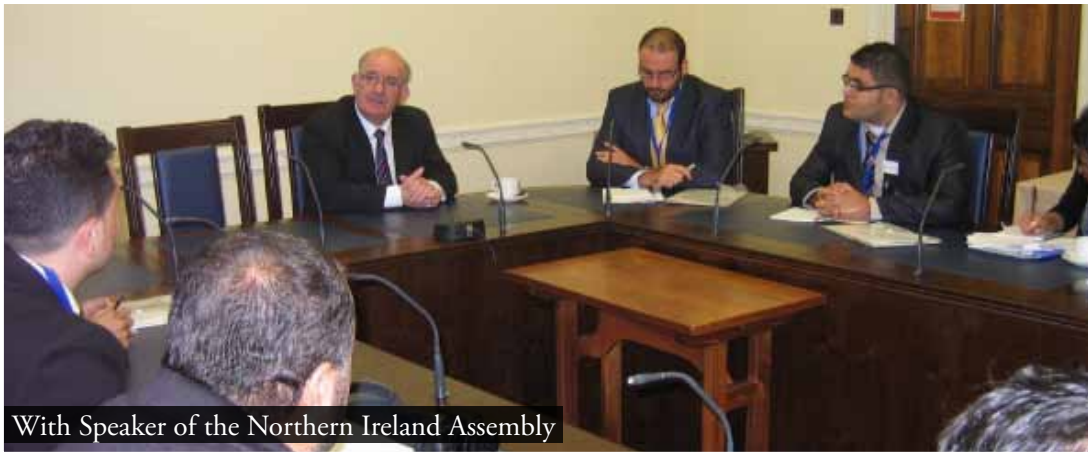
With Speaker of the Northern Ireland Assembly